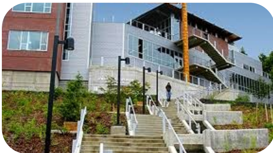
GRAYS HARBOR COLLEGE MAIN CAMPUS IN ABERDEEN, WA